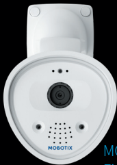
MOBOTIX ONE Fix