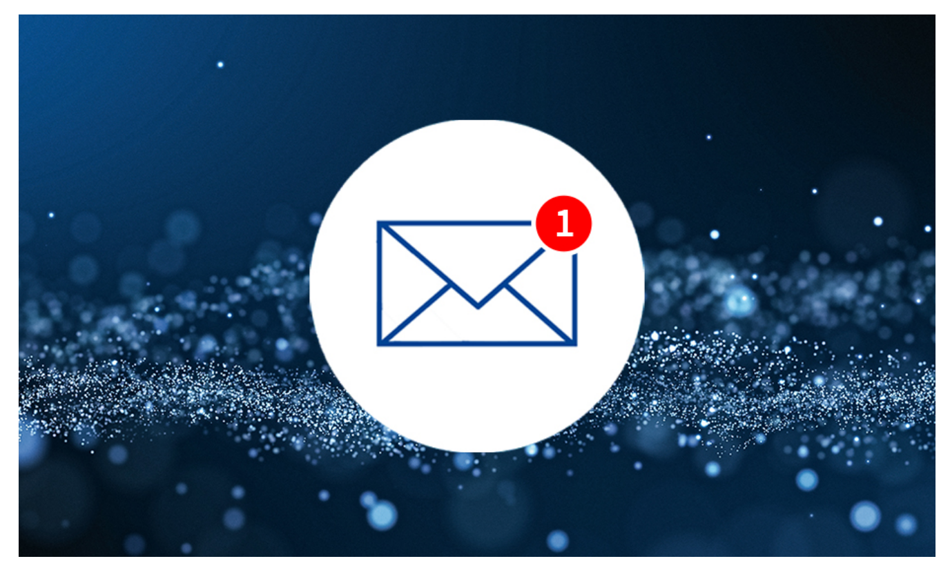
MOBOTIX at The 2018 Light+Building: More Flexibility and Userfriendliness, Concept for Cybersecurity